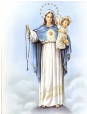
Our Lady of the Rosary